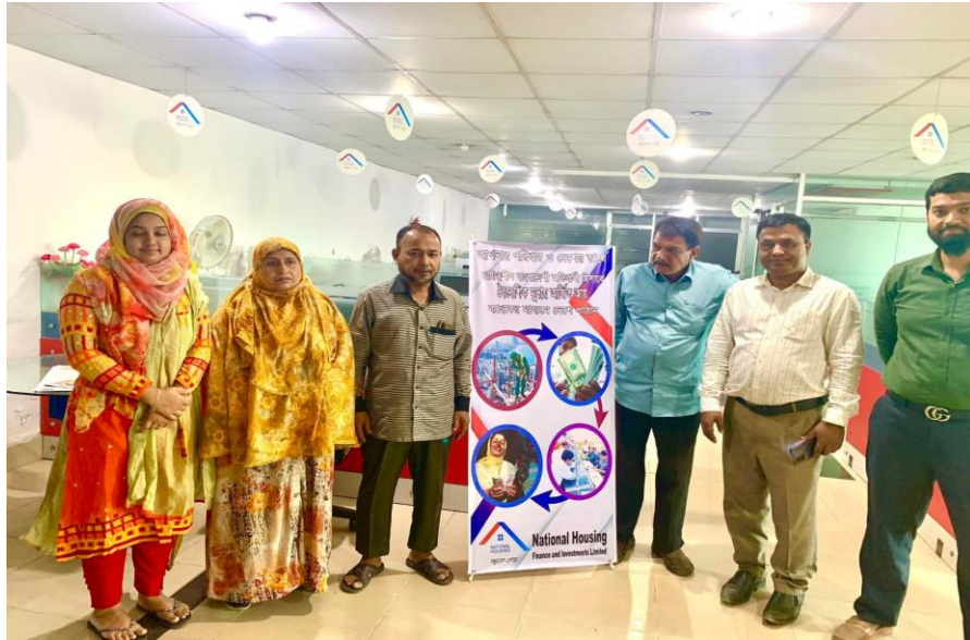
Figure: Bogura Branch