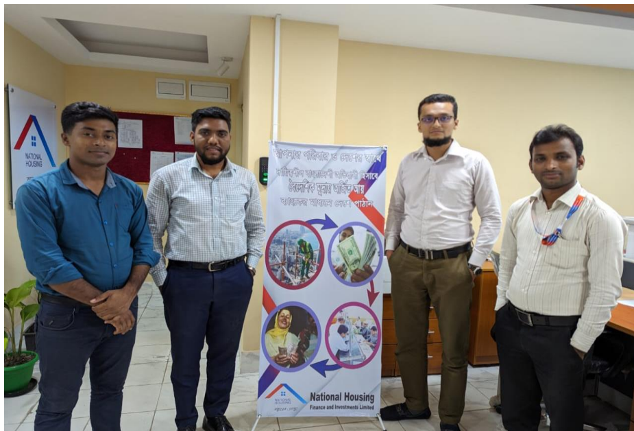
Figure: Khulna Branch