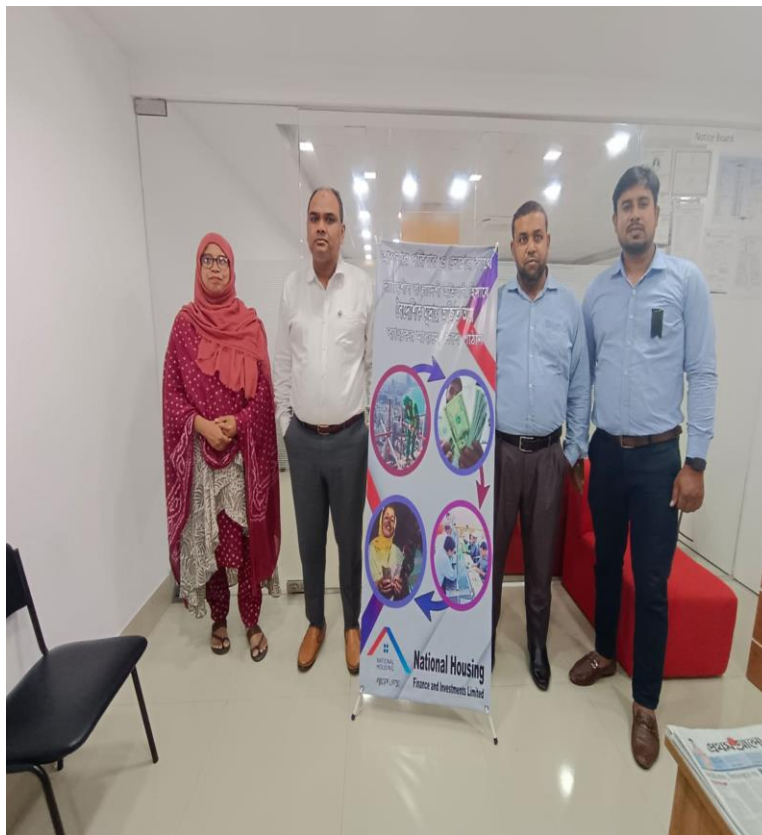
Figure: Rajshahi Branch