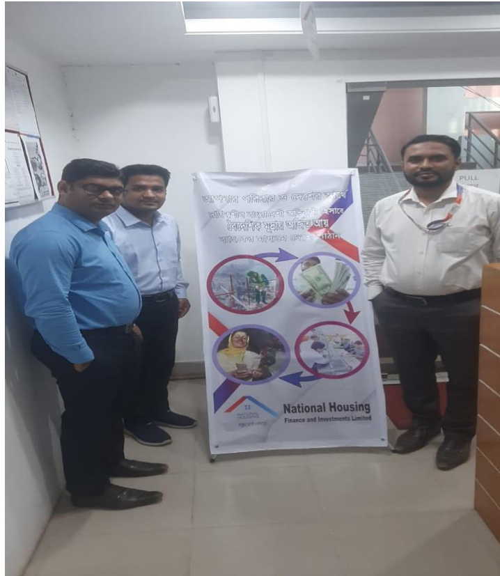
Figure: Feni Branch